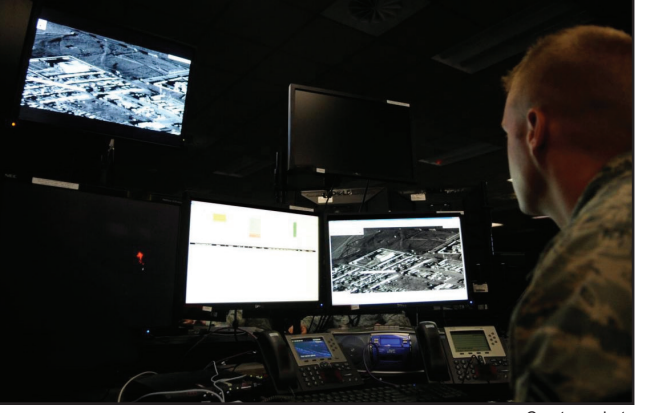
A Reserve ISR analyst provides around the clock direct support to war fighters in a theater of operations.

The 655th ISRG is still recruiting to fill the more than 160 open positions at six bases. Openings are available for Active Guard Reserve, Air Reserve Technician, Traditional Reserve, and civilian positions. Interested personnel should contact Master Sgt. Allen Hall at (937) 257-4607 or allen.hall.1@us.af.mil.